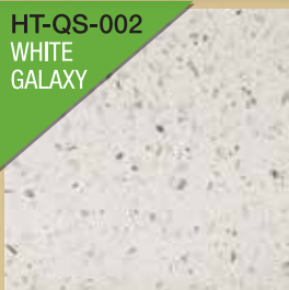
HT-QS-002 WHITE GALAXY