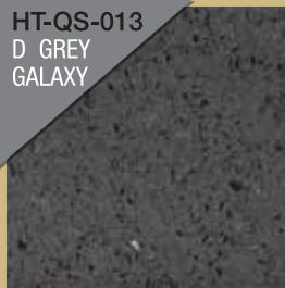
HT-QS-013 D GREY GALAXY