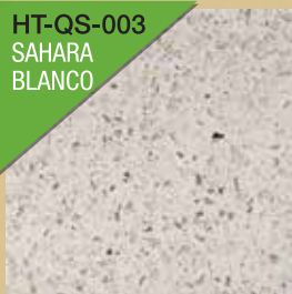
HT-QS-003 SAHARA BLANCO