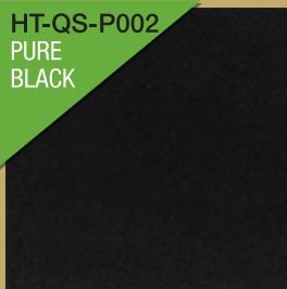
HT-QS-P002 PURE BLACK