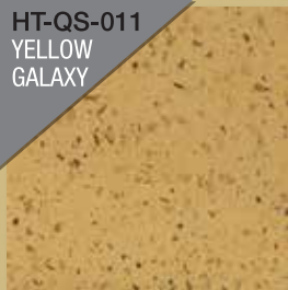
HT-QS-011 YELLOW GALAXY