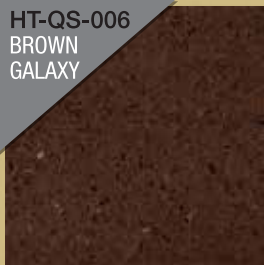
HT-QS-006 BROWN GALAXY