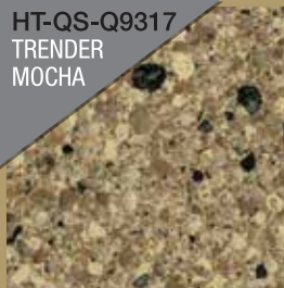
HT-QS-Q9317 TRENDER MOCHA