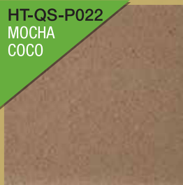
HT-QS-P022 MOCHA COCO