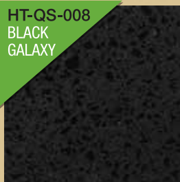
HT-QS-008 BLACK GALAXY