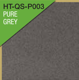
HT-QS-P003 PURE GREY